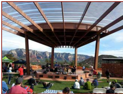
The new Posse Grounds Pavilion at Barbara Antonsen Park

We appreciate our wonderful Volunteer Park Rangers who assist with community events, and greet visitors and answer their questions every day of the year! The next time you see them, please let them know you appreciate them, too.