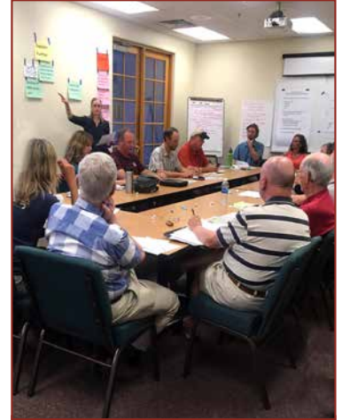
The OHV Work Group 2.0 pares down potential noise mitigation strategies.

Your expertise is welcome and valued. Sign up for a future work group at sedonaaz.gov/citizenengagement .