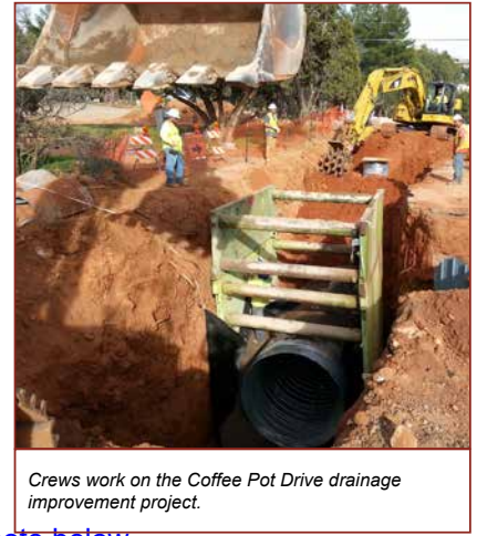
Crews work on the Coffee Pot Drive drainage improvement project.