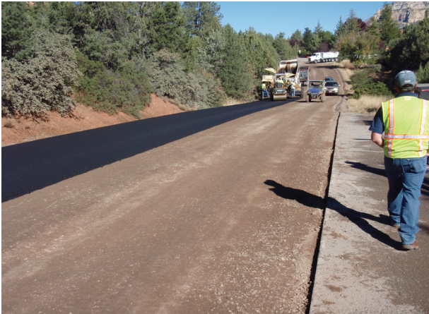
Soldiers Pass Road Paving

Planning is important to the maintenance of the environment of Sedona. Preventative maintenance of existing road, sewer, drainage, and parks systems are planned. For some systems, plans are made to upgrade and add to the systems. During the past year, over three miles of the City's approximately 106 miles of road were overlaid with new pavement. Soldiers Pass Road, a major City road, was one of the roads overlaid.