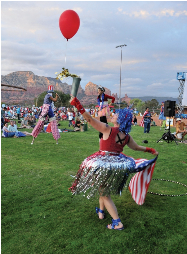
2012 Fourth of July Celebration

There is no need to leave the comfort and beauty of your home town this summer when there is so much to take part in and enjoy right here in Sedona! Let your local Parks and Recreation Department provide you with some of those great options.