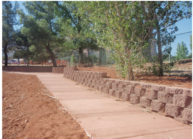
New Posse Grounds Park Walkway

about five miles west of the City along SR 89A. The open water wetlands are part of a plan to increase the ability of the plant to manage the treated water that remains at the end of the treatment process. Through a joint effort between a citizens group, the City's Parks and Recreation Department, and the Public Works Department, improvements were added to the wetlands to create the Sedona Wetlands Preserve, a new public park for the City. This is an ecological park that is a great place to walk, view birds, and take photographs. Ecotourism is a major tourist activity, which Sedona has positioned itself to benefit from.