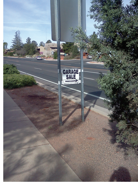
Sign placement not allowed

Every residential lot is allowed by City Code to have up to 200 square feet of screened outdoor storage space outside in the side or rear yards. Acceptable methods of screening are structures, fences, gates, or masonry wall. A permit may be required for certain types of screening. Before you create a screened outdoor storage area, please contact the Community Development Department at 282-1154 for more information and assistance.