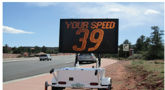
Speed Trailer on SR 89A

Our police officers, community service aides and volunteers are out in the city everyday conducting activities that are focused on making vehicle, pedestrian and bicyclist travel safe for everyone who lives in, works in or visits our community. Through funding made possible by our City Council and the Governor's Office of Highway Safety and by working together with our residents and visitors, we can achieve the goal to Drive Safe Sedona.