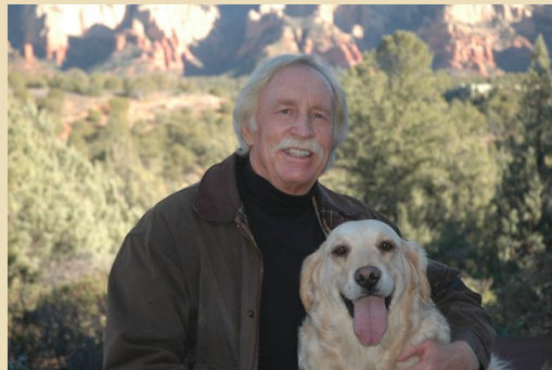
Mayor Rob Adams

Although we have had to "tighten our belt" during the economic downturn, we have worked diligently to provide for the health, safety and welfare of our citizens. The safety of SR 179 and SR 89A has been dramatically improved with dark sky compliant lighting. ADA compliant sidewalks have been constructed on both of these corridors. The City Council has accelerated the implementation of flood control improvements in large segments of the city. We have made substantial upgrades to our sewer treatment plant and infrastructure. The city helped to fund many vital community services, including an expansion of the kitchen at the Sedona Community Center, the Meals on Wheels program, and the operation of the Sedona Humane Society and the