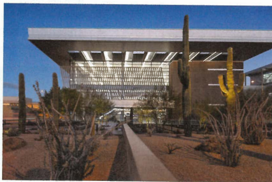
DESERT LIGHT The Sky Harbor Terminal 3 modernization project in Phoenix turned a concrete facade into one of glass and daylight.

The judges rated the projects based on five criteria: overcoming challenges and teamwork; safety; innovation and contribution to the community; construction quality and craftsmanship; and the function and/or aesthetic quality of the design.