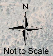
SR179 Sewer Main Replacement Project Location Map