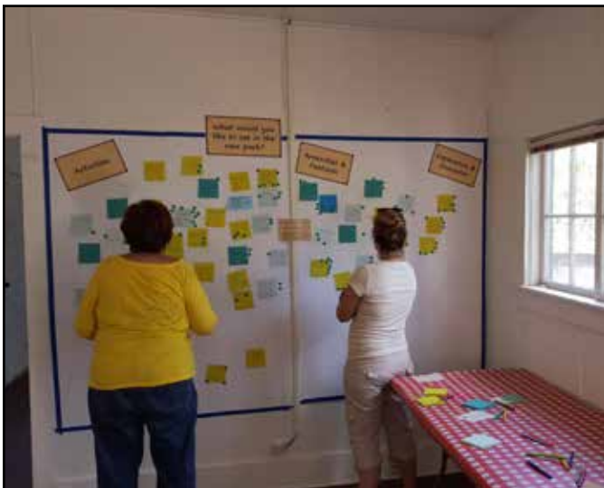
May 30, 2015 Community Open House