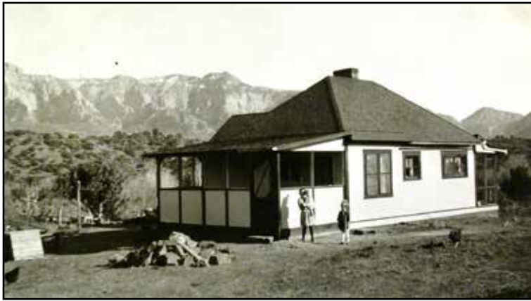
circa 1917-23