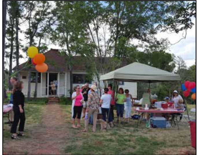
May 30, 2015 Community Open House